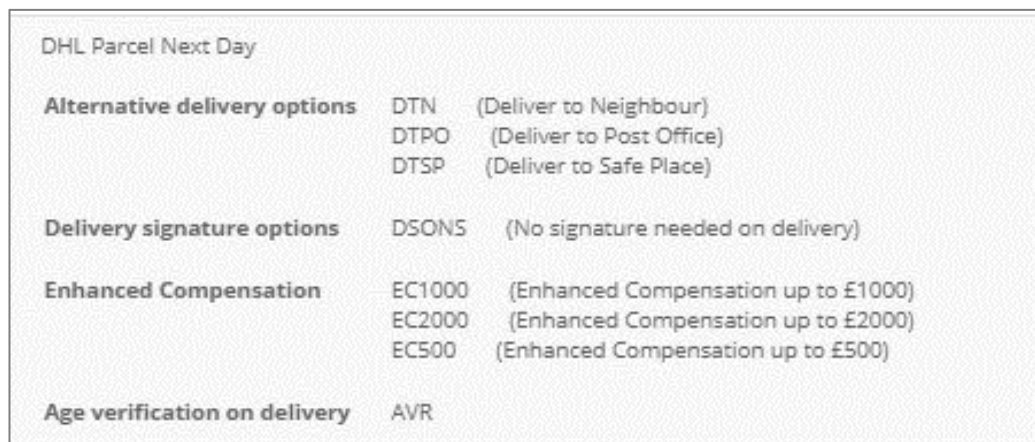
Figure 3: View Enhancements for Service