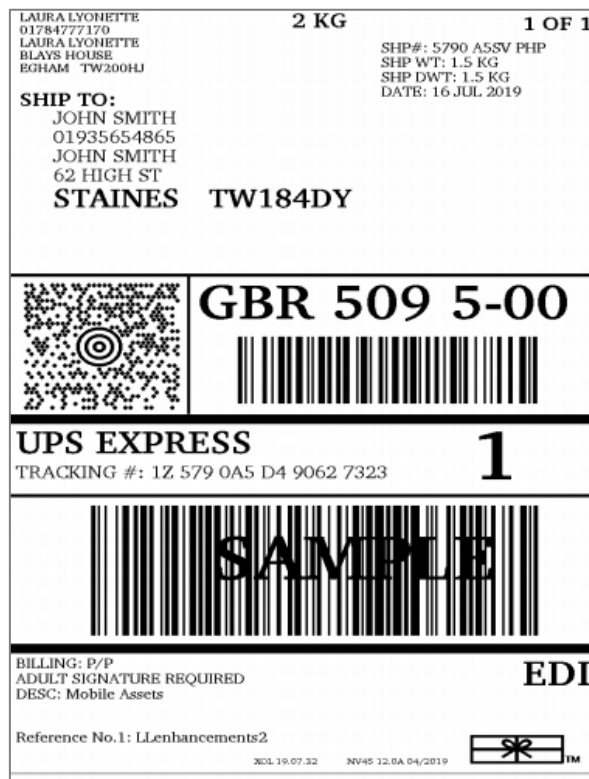
Figure 9: Example UPS label with 'Adult Signature Required' service enhancement (in bottom left corner)

NOTE: The service enhancement(s) may not be indicated on the label, depending on the type of enhancement(s) used. For example, enhancements relating to delivery instructions such as Saturday delivery or adult signature required on delivery are usually shown on the label, whereas SMS or email notification enhancements are not.