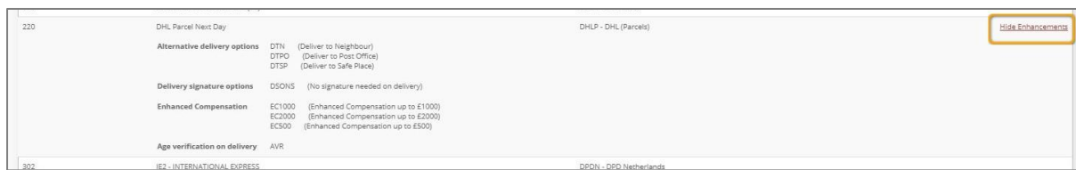
Figure 2: View Service Enhancements link selected